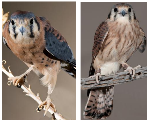
Male and female American kestrels. They are smaller, with gray coloring on the head and a reddish tail and back.