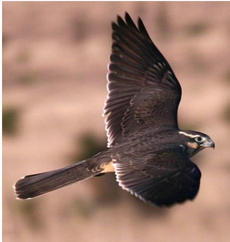
Notice the white trailing edge on the wings, light eye stripe and long tail.

What to do: If you think you see an aplomado falcon, please record the time and date, location and a brief description of the sighting. Send these along with your name and contact information to the e-mail addresses below. Please, do not get too close and never approach a suspected aplomado falcon nest site.