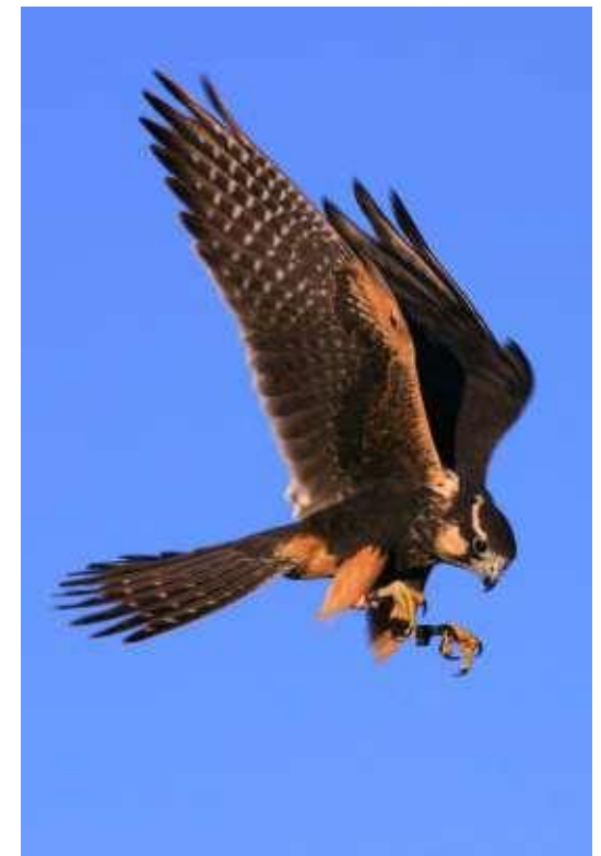
Juvenile aplomado falcon