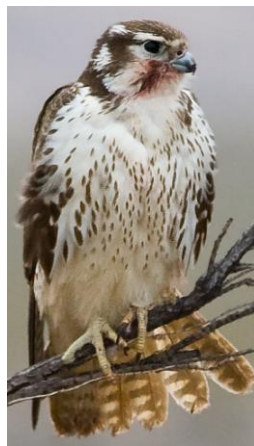
Prairie falcons are larger and do not have a dark band across the abdomen like aplomados.