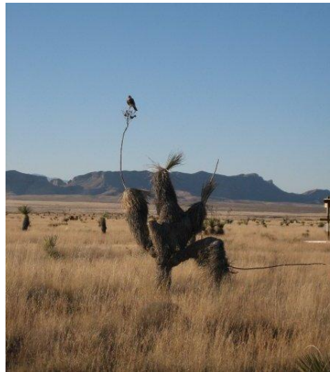
An aplomado falcon perched on a yucca stalk near a reintroduction site. Notice the open grassland habitat.

The aplomado falcon is associated with grassland savannas of eastern Mexico and the Chihuahuan Desert.