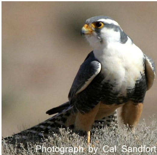
An adult aplomado falcon. Notice the white breast with no speckling.

The falcon's historical range in the U.S. included southeastern Arizona, southern New Mexico, and Trans-Pecos and southern Texas.